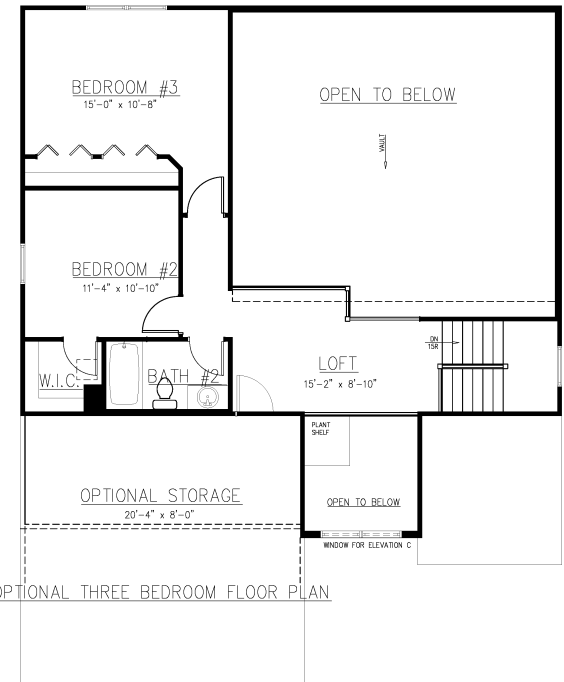
OPTIONAL THREE BEDROOM FLOOR PLAN