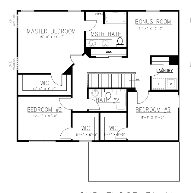
2ND FLOOR PLAN 3 BEDROOM & BONUS ROOM